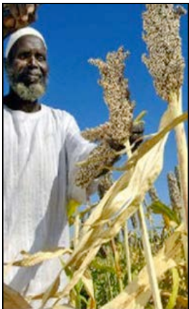
Agriculture and food security