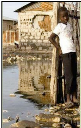
Disaster risk reduction